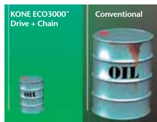
Oil use comparison