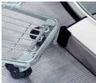
Trolley protection in autowalks