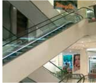
Primed sheet steel cladding