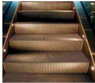
Skirt spot lights