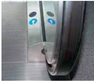
Traffic lights on decking