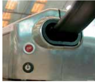
Stainless steel front plate