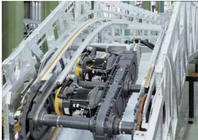
KONE EcoMaster™ Drive