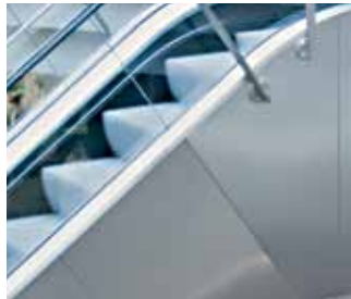
Stainless steel cladding