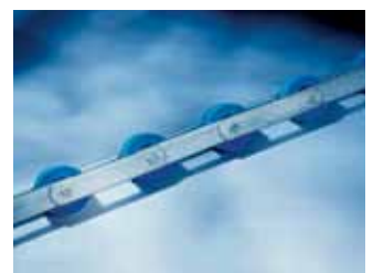
Lubrication free chain