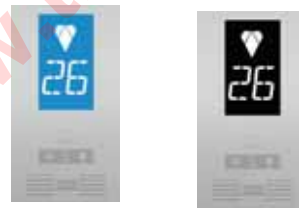
White with blue or black background