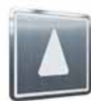
Flush mounted, Brushed