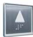
Flush mounted, Brushed