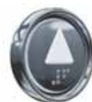
Surface mounted, Mirror polished