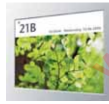
Available for swing COP