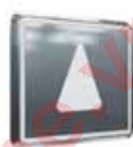
Surface mounted, Mirror polished