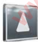
Surface mounted, Mirror polished