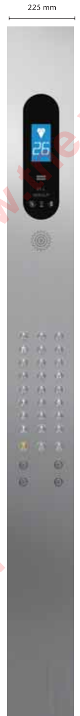
Full height COP Brushed stainless steel faceplate