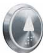
Brushed stainless steel with Braille