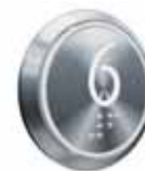
Brushed stainless steel with Braille