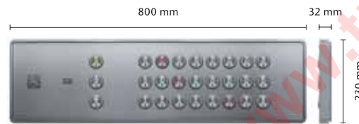
Stainless steel faceplate