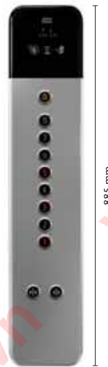
Partial height COP-2 Brushed stainless steel faceplate