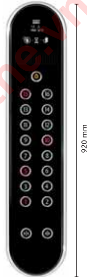
Partial height COP-1 Black electroplated stainless iron faceplate