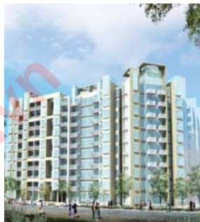
The Canary Apartment, Binh Duong 6 Passenger lifts 1000kg, 1.75 m/s