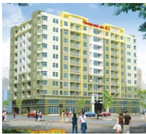
Son Ky 2 Apartment, HCMC 4 Passenger lifts 750-1000kg, 1.5 m/s