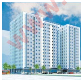
Ngo Gia Tu Apartment Block B, HCMC 7 Passenger lifts 900-5000kg, 1.5 & 1.75 m/s