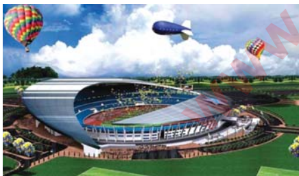
Trengganu Stadium, Trengganu, Malaysia