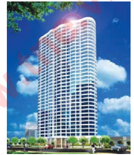
The Azura Apartment, Da Nang City 3 Passenger lift 1000kg, 3 m/s