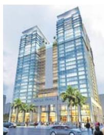
Vincom Center Tower, HCMC 2 Car lifts 3000kg, 0.5 m/s