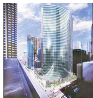
Hyatt Center, Chicago