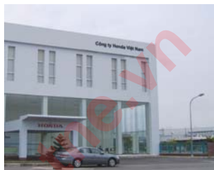
Honda Vietnam Factory, Vinh Phuc 4 Cargo lifts 1000 & 2000kg, 0.5 m/s