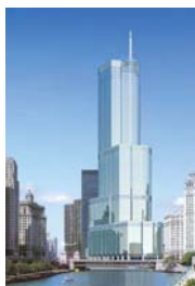
Trump Tower, Chicago