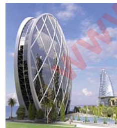
Aldar HQ, Abu Dhabi, United Arab Emirates