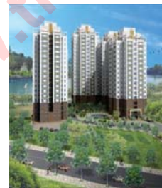
Phu My Thuan Apartment, HCMC 8 Passenger lifts 1000kg, 1.75 m/s