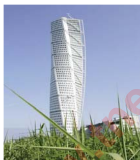
Turning Torso, Malmö