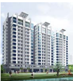
Thu Thiem Star 1 Apartment, HCMC 6 Passenger lifts 750 & 1000kg, 1.5 m/s