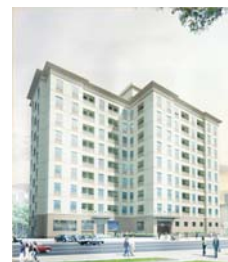
9T1 Apartment, Hanoi Capital 2 Passenger lifts 1000kg, 1.75 m/s