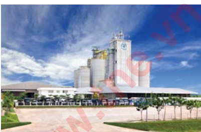
C.P. Group Factory, Binh Duong 2 Cargo lifts 1350 & 2000kg, 1.0 & 1.5 m/s