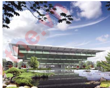
Hanoi Museum, Hanoi Capital 2 Passenger lifts 1275kg, 1.6 m/s