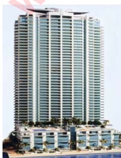
The Jade, Miami