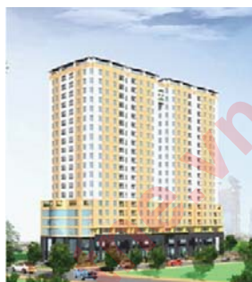
Khanh Hoi 2 Apartment, HCMC 5 Passenger lifts 600-1020kg, 1.75 m/s