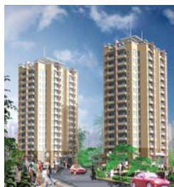
Ben Ba Dinh Apartment, HCMC 4 Passenger lifts 1000kg, 1.75 m/s