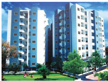
My Loi Apartment, My Tho City 6 Passenger lifts 500kg, 1.5 m/s