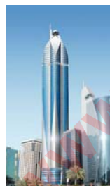
Rosa Rotana, Dubai