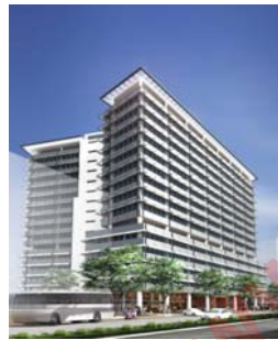
Centre Point Tower, HCMC 8 Passenger lifts 2000kg, 1.75 & 2.5 m/s