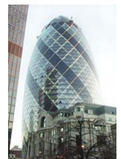
Swiss Re, London