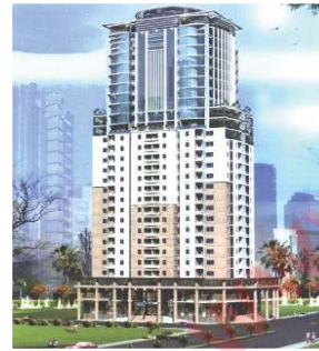
SaigonRes Tower, Vung Tau City 4 Passenger lifts 1000 & 1150kg, 1.6 m/s