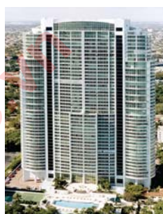
Santa Maria, Miami