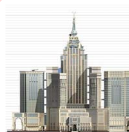
DOKAAE Mecca, Saudi Arabia