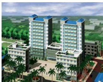
Hanoi Textile - Garment Industry College, Bac Ninh 4 Passenger lifts 1000kg, 1.5 m/s