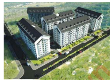
E.Home Dong Saigon 2 Apartment, HCMC 10 Passenger lifts 900-1000kg, 1.5 m/s