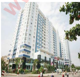
An Suong Apartment, HCMC 6 Passenger lifts 800 & 1000kg, 1.6 m/s