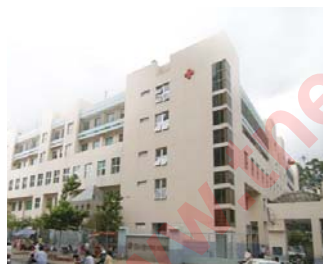
Hung Vuong Hospital, HCMC 5 Bed lifts 1000-1300kg, 1.0 m/s