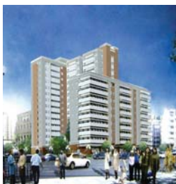
Nguyen Bieu Apartment, HCMC 10 Passenger lifts 750-1000kg, 1.5 m/s