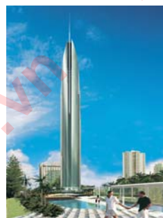
Q1, Gold Coast