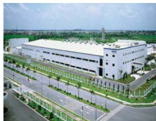
TOTO Factory, Hanoi 8 Cargo lifts 2000 & 2500kg, 0.5 m/s