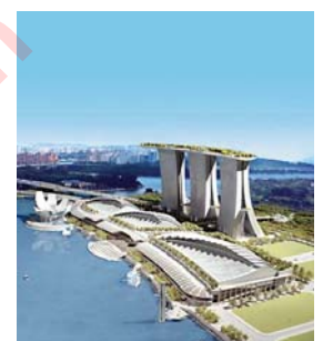
Marina Bay Sands, Singapore