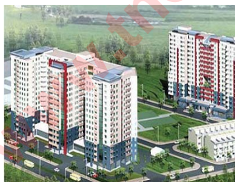
Tan Kien Apartment Block A&B, HCMC 18 Passenger lifts 800-1000kg, 1.75 m/s