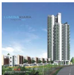
Lumina Kiara, Kuala Lumpur, Malaysia