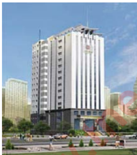
194 Golden Building, HCMC 3 Passenger lifts 630-1020kg, 1.75 m/s