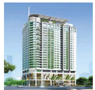
Tan Da Court Apartment, HCMC 6 Escalators & 4 Passenger lifts 1360kg, 1.75 & 2.5 m/s