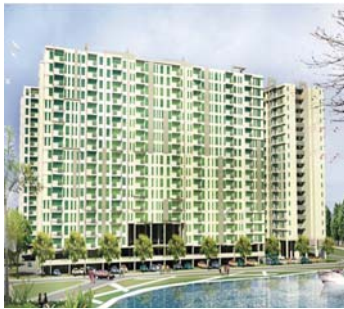
An Phu - Binh Khanh Apartment, HCMC 10 Passenger lifts 1600 & 2000kg, 1.75 m/s