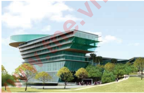
JW Marriot Hotel, Hanoi Capital 10 Passenger lifts 1600 & 2000kg, 1.75 m/s