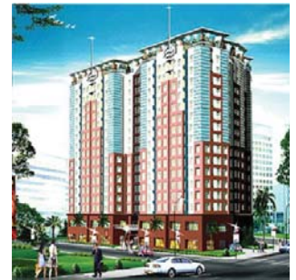
Sacomreal Apartment, HCMC 8 Passenger lifts 630 - 1000kg, 1.0 m/s