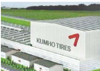
KUMHO TIRES Factory, Binh Duong 2 Cargo lifts 5000kg, 0.5 m/s