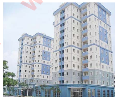
Thanh My Loi Apartment, HCMC 6 Passenger lifts 800 & 900kg, 1.75 m/s