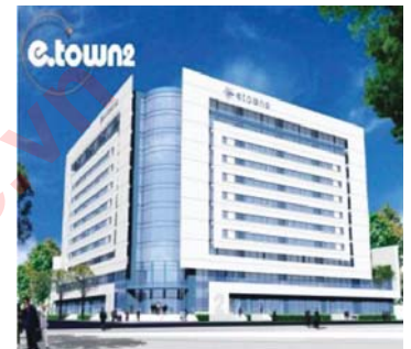
E.Town 2 Building, HCMC 6 Passenger lifts 1600 - 2000kg, 1.75 & 2.5 m/s