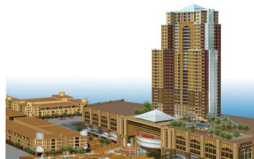
The Strand, Malaysia