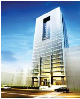
Ree Tower, HCMC 6 Passenger lifts 1650 & 2000kg, 2.5 & 1.7 m/s