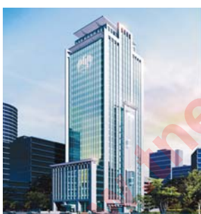
Krung Thai Bank New Headquarters, Bangkok