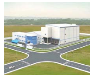
Rohto Mentholatum Factory, HCMC 3 Cargo lifts 2500kg, 0.5 m/s