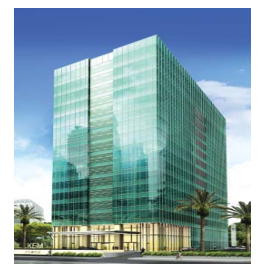
KEM office, Indonesia