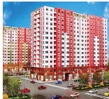
Thai An Apartment, HCMC 5 Passenger lifts 800 - 1600kg, 1.75 m/s