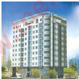
Thien Nam Apartment, HCMC 2 Passenger lifts 800-1000kg, 1.6 m/s