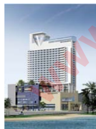
Oriental Tower, Nha Trang City 3 Passenger lifts 1000kg, 1.75 m/s