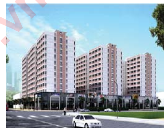
Tan My Apartment, HCMC 12 Passenger lifts 900kg, 1.5 m/s