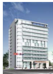
Education & Training Service Building, HCMC 3 Passenger lifts 1000kg, 1.75 m/s