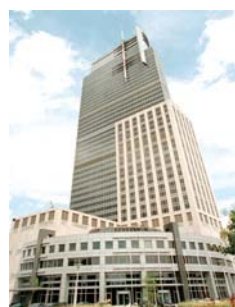
Daewoo Center, Warsaw